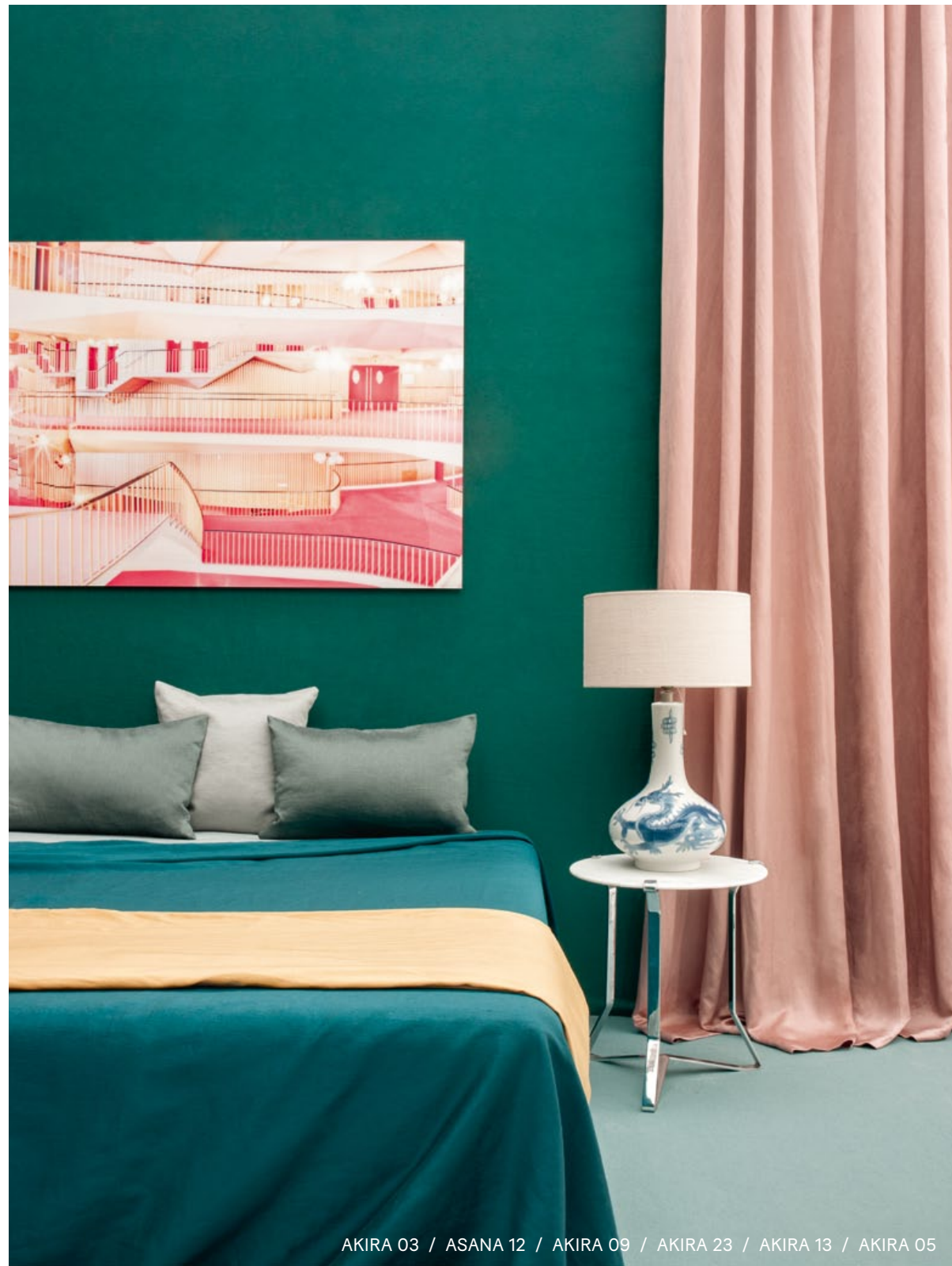
AKIRA 03 / ASANA 12 / AKIRA 09 / AKIRA 23 / AKIRA 13 / AKIRA 05