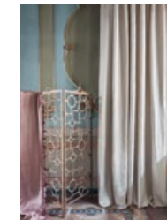
Akira pag. 22