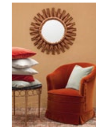
Eternal pag. 28