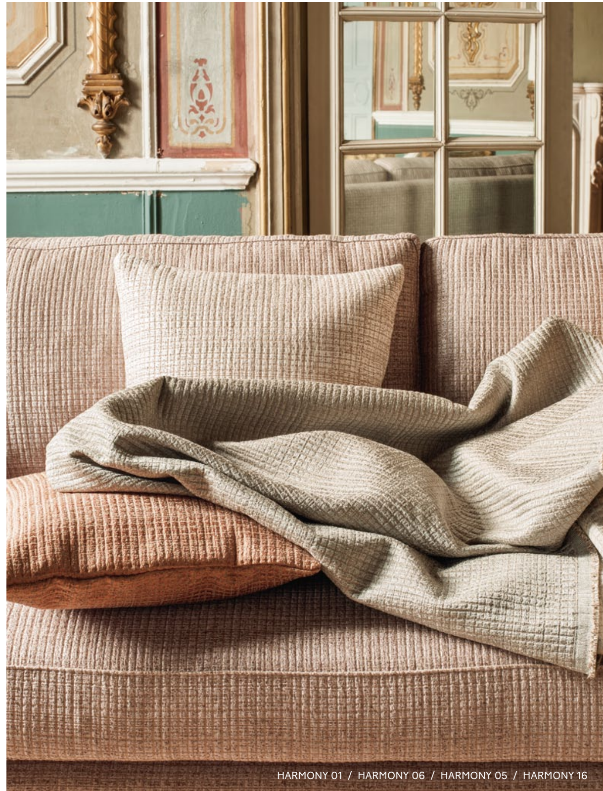
HARMONY 01 / HARMONY 06 / HARMONY 05 / HARMONY 16