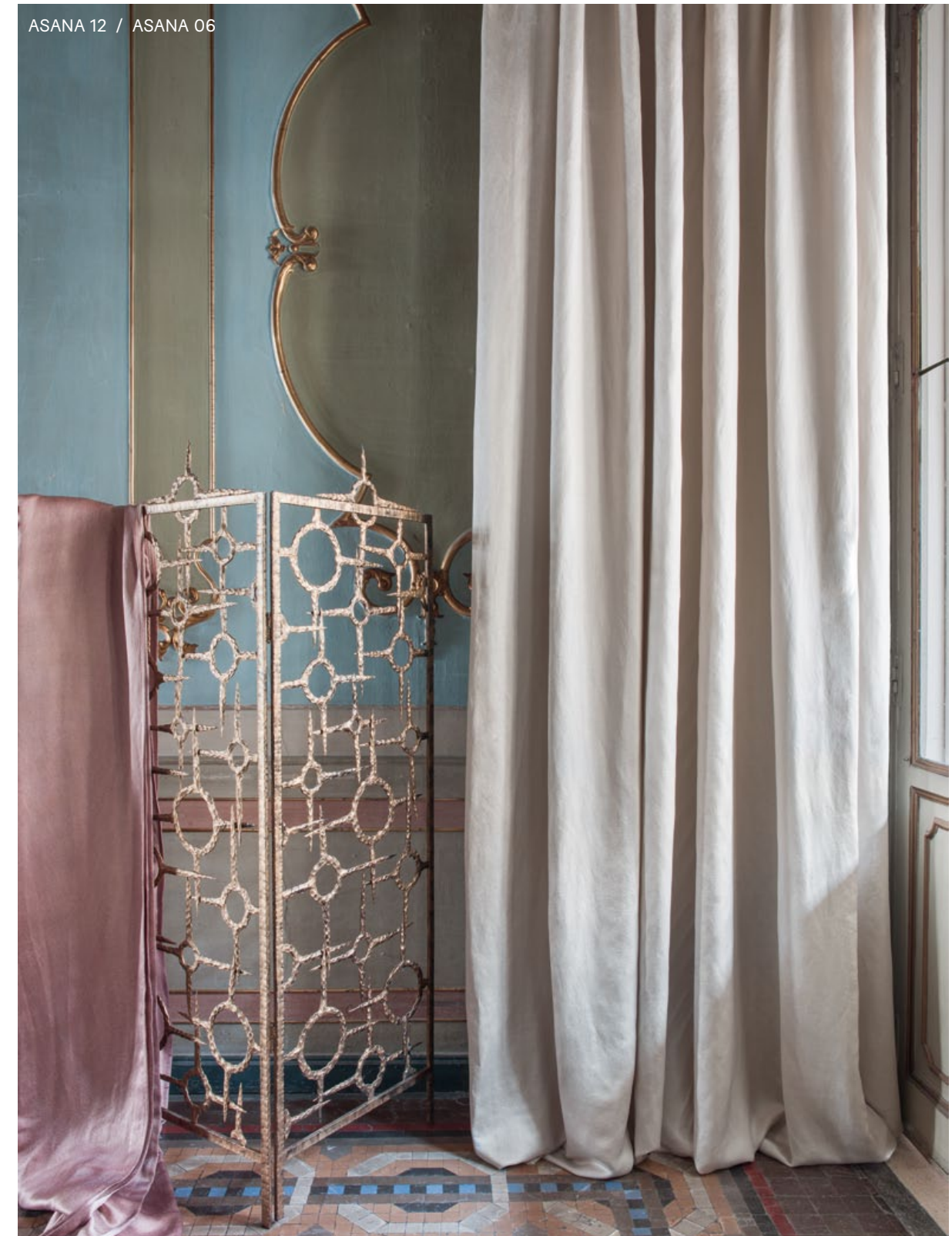
ASANA 12 / ASANA 06