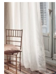
Om pag. 30