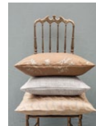
Rituals pag. 12