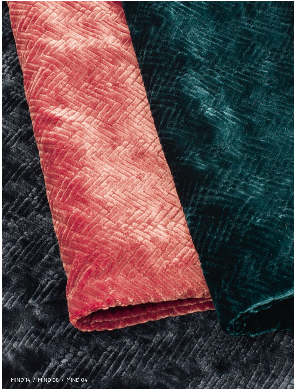
MIND 14 / MIND 08 / MIND 04