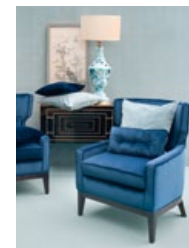
Guru pag. 26