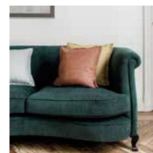
Pág. 19 Ville 23 Kibanda 05 Igloo 08 Kibanda 17