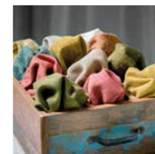
Pág. 20 Igloo 05 Igloo 03 Kibanda 17 Igloo 14 Igloo 15 Igloo 18 Kibanda 18 Ville 16 Igloo 43 Kibanda 63 Ville 22 Kibanda 05