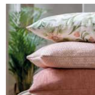
Pág. 11 Colette 03 Tuile 02 Ville 12