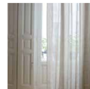
Pág. 16-17 Ushuaia 16