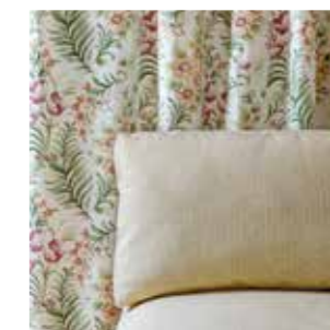
Pág 6 Colette 03 Tuile 05