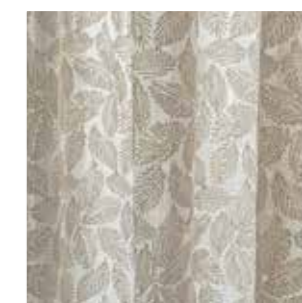
Pág. 14 Tineo 06