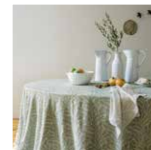
Pág. 5 Herbes 03 Wise 06 Herbes 06