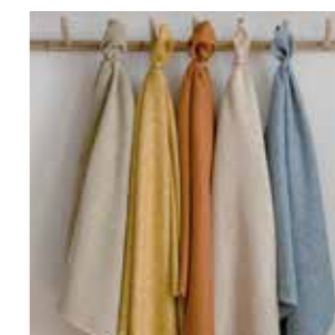
Pág. 18 Ville 09 Igloo 15 Kibanda 08 Igloo 26 Igloo 04