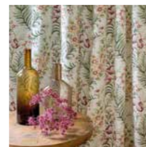
Pág. 7 Colette 03