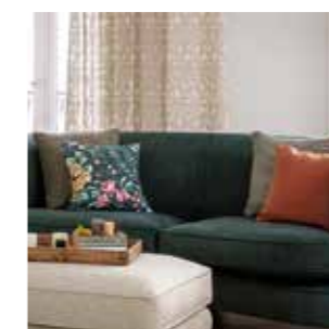
Pág. 12- 13 Ville 23 Gabrielle 08 Ville 18 Colette 08 Tineo 06 Tuile 06 Ville 36